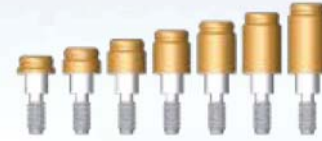
LOCATOR Implant Abutments Many Tissue Cuff Heights are available.