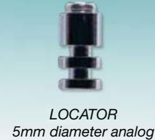
LOCATOR 5mm diameter analog