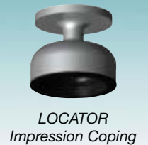
LOCATOR Impression Coping