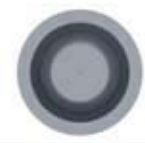
LOCATOR Processing Replacement Male