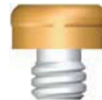
LOCATOR Bar Female