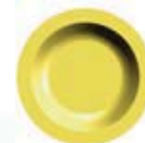
LOCATOR Yellow Bar Processing Replacement Male

Zest Anchors, LLC provides a limited warranty for its products, to the original purchaser, to be free from defects in workmanship and materials under normal use and service, for a period of one year from the date of purchase. Accumulation of abrasive plaque can damage any dental attachment and proper patient hygiene is essential.