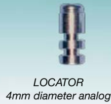
LOCATOR 4mm diameter analog

The LOCATOR Impressing Coping (8505) is designed to be picked up with impression material. The LOCATOR 4mm analog (8530) is indicated for all implants up to 5mm in diameter while the 5mm analog (8516) is used for implants with a 5mm or larger diameter. For complete instructions please refer to the LOCATOR Implant Attachment System Technique Manual (L8002-TM) as listed on the Zest Anchors web site ( www.zestanchors.com ).