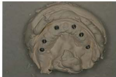
Pour model and drill holes in denture