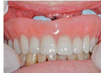
Reline impression over low-profile copings