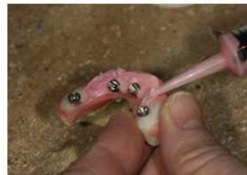
Hard reline tissue side and polish