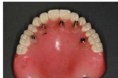
Remove flanges and palate