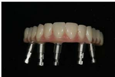
Attach analogs and make verification index